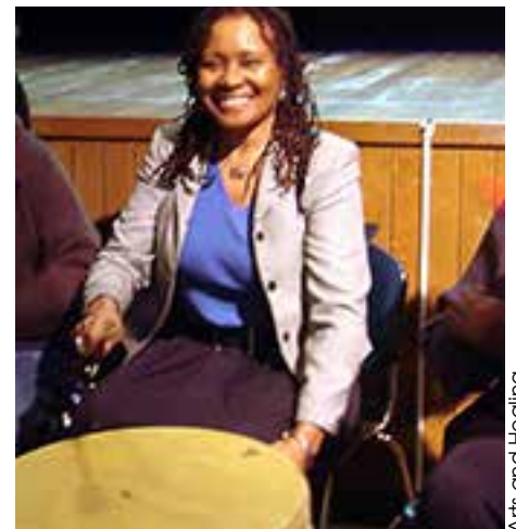
Arts and Healing

2626 33rd Street, Santa Monica, CA 90405 • 310-452-1439 • www.uclartsandhealing.net/training.aspx