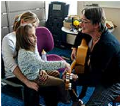
Maya's Music Therapy

Maya's Music Therapy Fund is an effective, small, independent organization in San Francisco's East Bay. They develop and deliver music therapy programs to people with moderate to severe developmental disabilities, who suffer from a scarcity of services and resources. These programs are designed to improve communication skills, decrease inappropriate behavior, enhance social