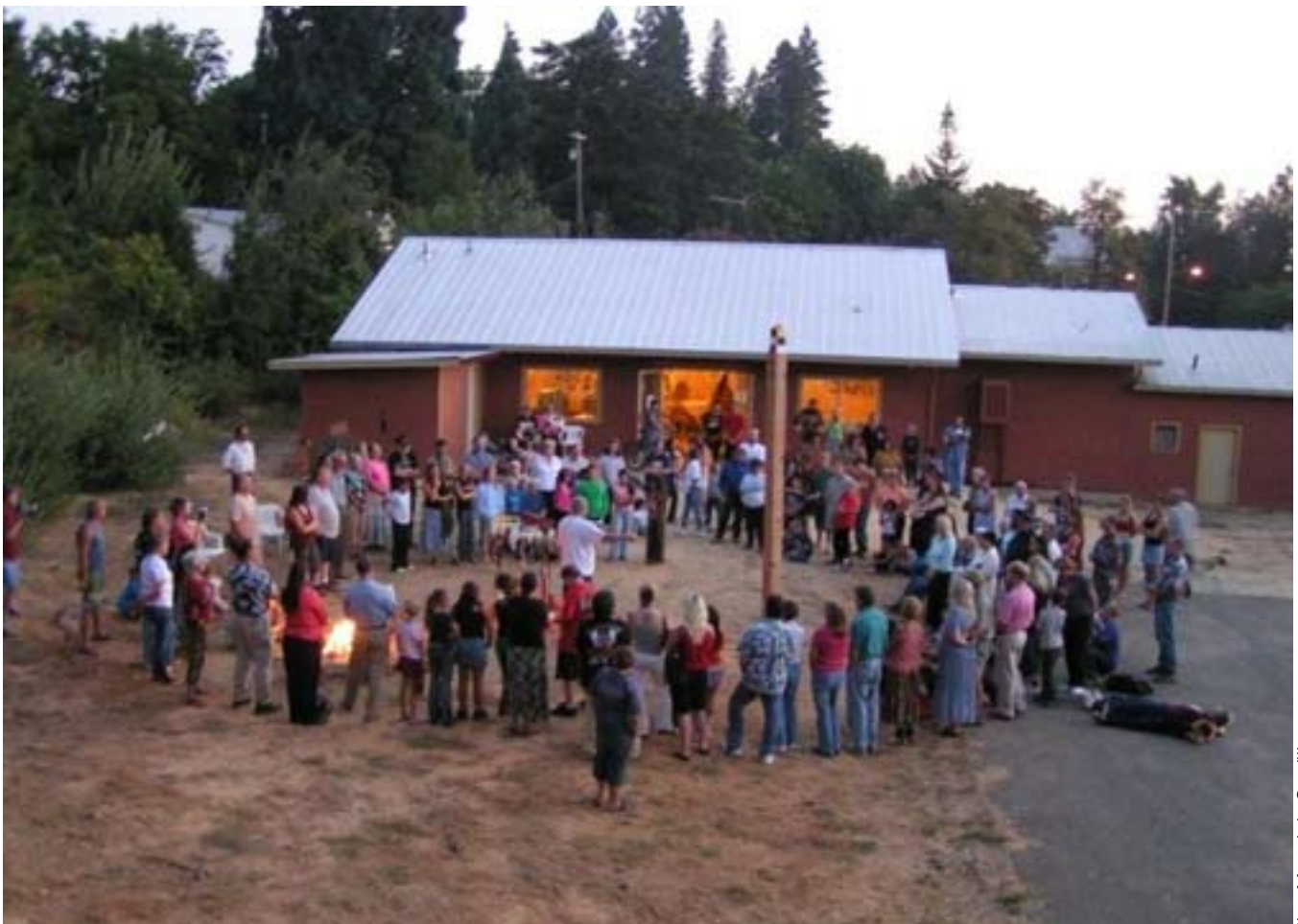
Blue Mountain Coalition

The first Jerry Garcia celebration happened in 2002 as a fundraiser for Crocker Amazon Playground in Jerry Garcia's childhood neighborhood – The Excelsior District. Spearheaded and conceived by Excelsior District natives and residents, this civic and cultural event is the largest event associated with the neighborhood. It is wholeheartedly embraced by the community, and the City and