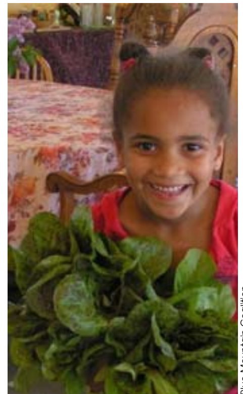
Blue Mountain Coalition

9507 Ronleigh Drive, Baltimore, MD 21234 410-864-1812 • www.rockhouseworld.org