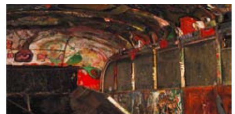
The Merry Prankster bus – Furthur inside

PO Box 3346, Eugene, OR 97403 www.Libweb.uoregon.edu/giving/kesey.html