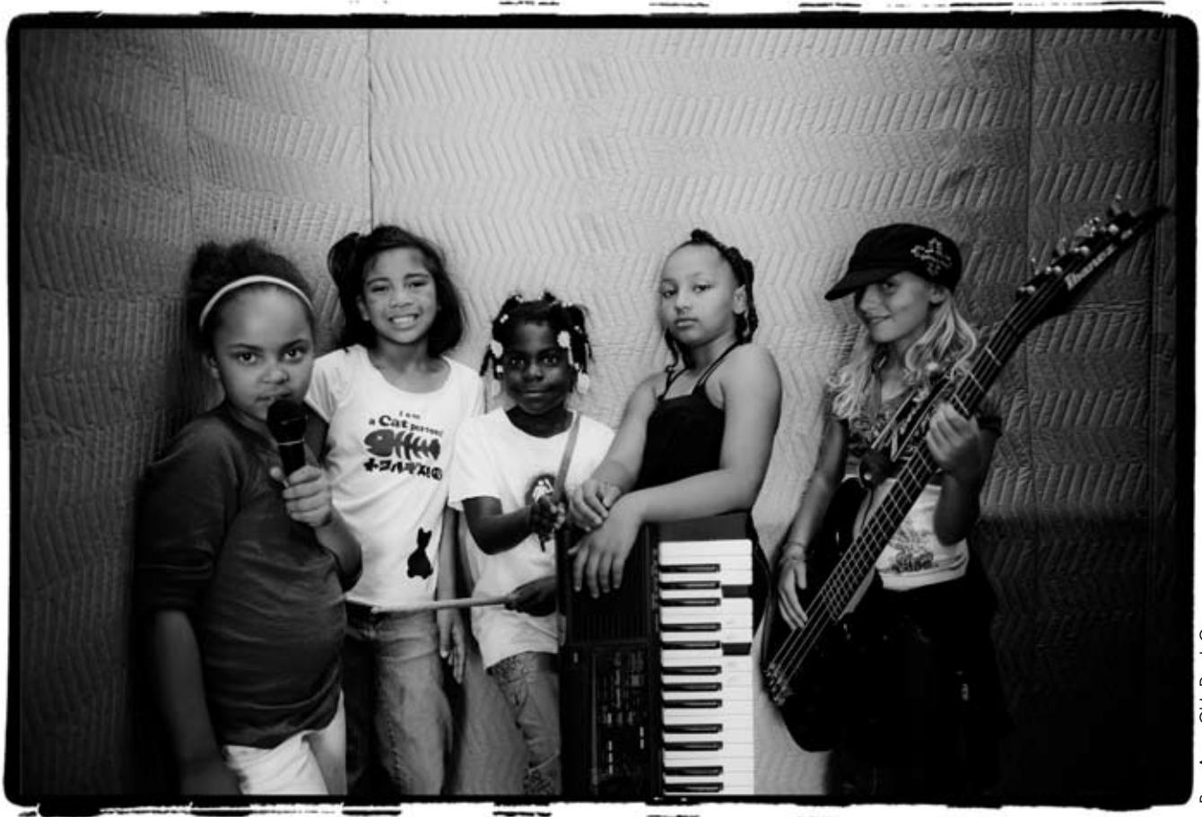
Bay Area Girls Rock Camp