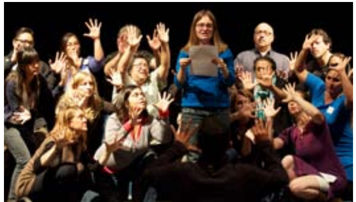
Participants of the Aug.3-5 Institute Rehearse for Their Culminating Presentation