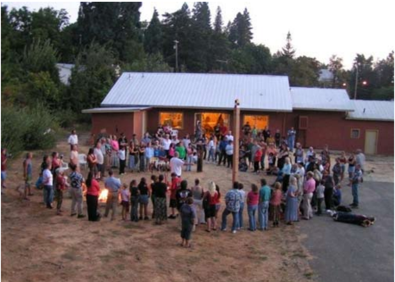
Blue Mountain Coalition

The first Jerry Garcia celebration happened in 2002 as a fundraiser for Crocker Amazon Playground in Jerry Garcia's childhood neighborhood – The Excelsior District. Spearheaded and conceived by Excelsior District natives and residents, this civic and cultural event is the largest event associated with the neighborhood. It is wholeheartedly embraced by the community, and the City and