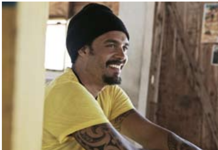
Arts For Humanity! and Michael Franti, recipients of the 2010 Jerry Garcia and Ralph J. Gleason Awards (see page 2)