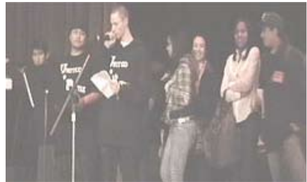
Balboa High School Singers

subsequently worked with what the students created. On December 10th, the 60th Anniversary of the signing of UDHR, Balboa students presented a compilation of original songs, poems, video animations, spoken word and musical performance at a full school assembly, to convey their ideas about human rights and UDHR.