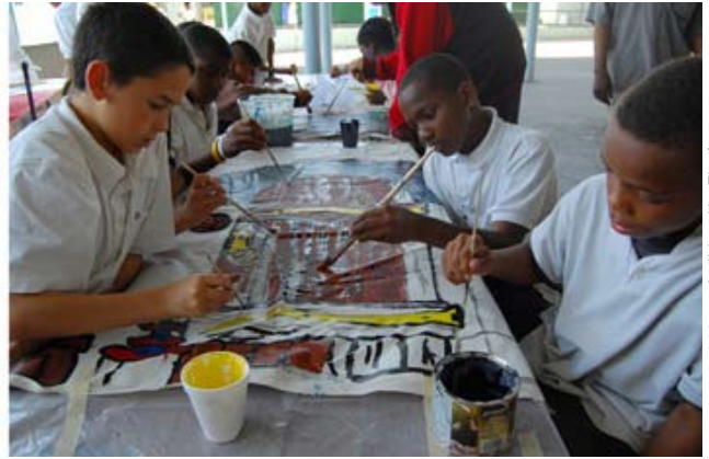
Theatre of Hearts/Youth First

of race and cultural difference. Programs reach children everywhere - in the heart of their neighborhood, schools, churches, community centers and libraries.