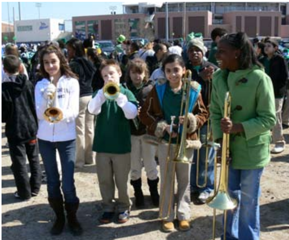
Bridgeport School District Music Programs

UpBeat Drum Circles was begun to help rebuild the spirits of the people in northern Iraq. The Kurdistan Save the Children program is a section of this program that works to ensure a better future for children in Kurdistan through improving their family, economic, social, psychological, health, education, and housing conditions. The Rex grant will support the establishment of ongoing drum circles at all seven Kurdistan Save the Children Youth Activity Centers in northern Iraq, including Sulymania, Koya, Rania, Kalar, Darbar-dikahan, Khanaqem, and Kirkuk. PO Box 55245, Stevenson Ranch, CA 91385-0245 www.ubdrumcircles.com